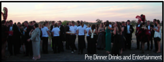
Pre Dinner Drinks and Entertainment